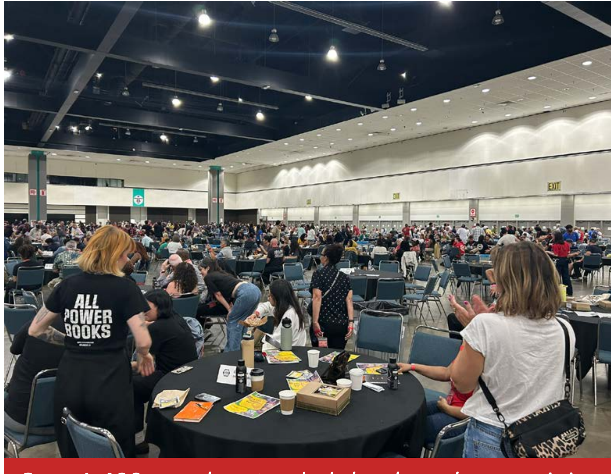
Over 1,400 people attended the three-hour training seminar, the largest in Los Angeles history.

The interactive session offered a collaborative space to build courage, clarity, and community, and equipped participants with the principles and practical tools of non-violent direct action. Everyone in attendance was provided with a bilingual (English/Spanish) "Know Your Rights" card, available to download/print here .