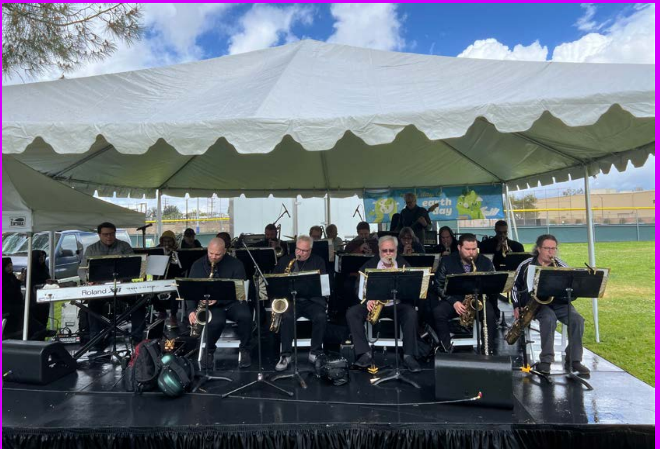
The Valley Jazz Orchestra performing an MPTF gig at Ralph Foy Park on April 26.